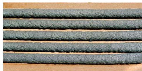
FIVE .19 DIAMETER BEADS ON 16' ROLL FORD # ESB-M4G32-A