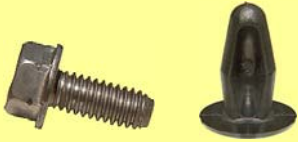
S NO FINISH Natural Material