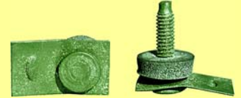
S32 GREEN DIP SPIN Pea Green