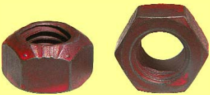
S60 PHOSHATE & RED Dull Red