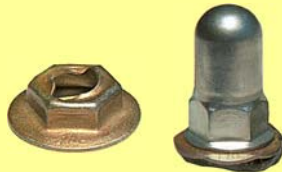
M MECHANICAL Matte